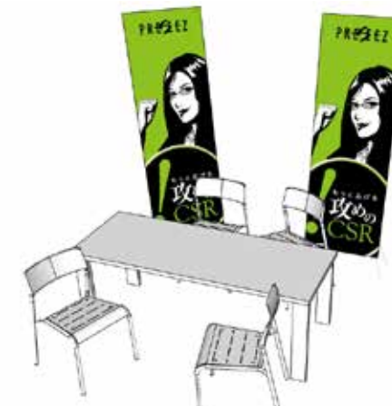
Working place in Odessa

The standard furniture of an exhibition stand is as follows: